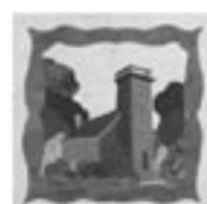
Little Brown Church