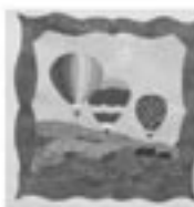
Hot Air Balloons