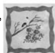
State Bird Goldfinch