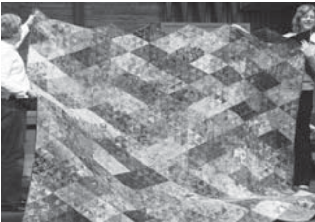
Shawn McMMain started cutting triangles and just couldn't stop to make this colorful quilt.