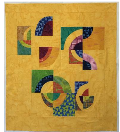
Crib Quilt made in modern batiks

Kit fee due at workshop: $8.00 (Includes full color instructions and layouts)